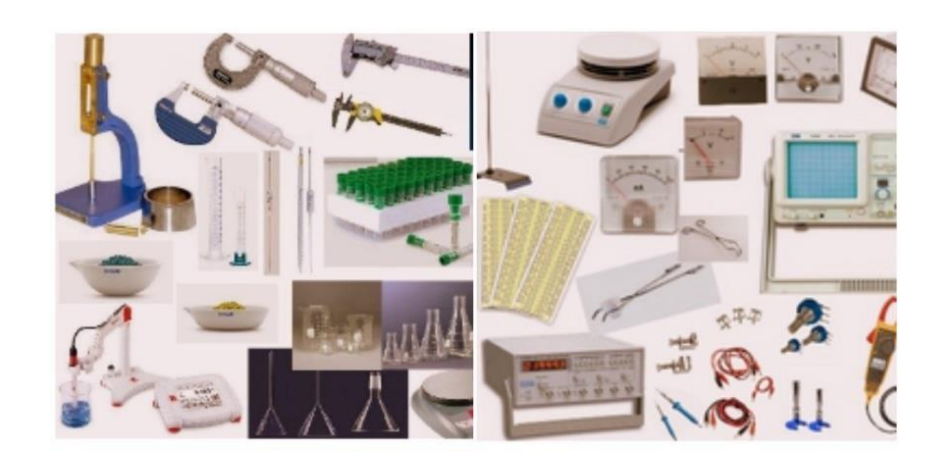
Fig. 7.5.3 Some equipment in Measurement Laboratory

The measurement laboratory is equipped with electrical and electronic measuring equipment as well as physical, thermal, mechanical and surveying equipment as shown in Fig. 7.5.3. Proper use of measuring instruments is essential in order to obtain accurate measurements as well as to maintain measuring instruments in good condition.