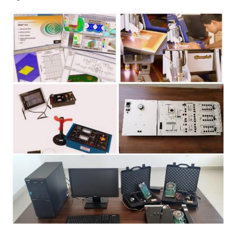
Fig. 7.5.2 Some equipment in Electrical Machines and Communication Laboratory

This laboratory is equipped with ANSYS package software such as HFSS, Designer, Q3D Extractor, and Siwave which can be used for PCB designing, antenna designing, electromagnetic simulation etc. Chemical free automated PCB prototyping machine with latest technology used for printing circuits and Educational trainer kits used to enhance the technical skills of students and to teach the basic principles of energy and electricity are also available in the laboratory as shown in Fig. 7.5.2.