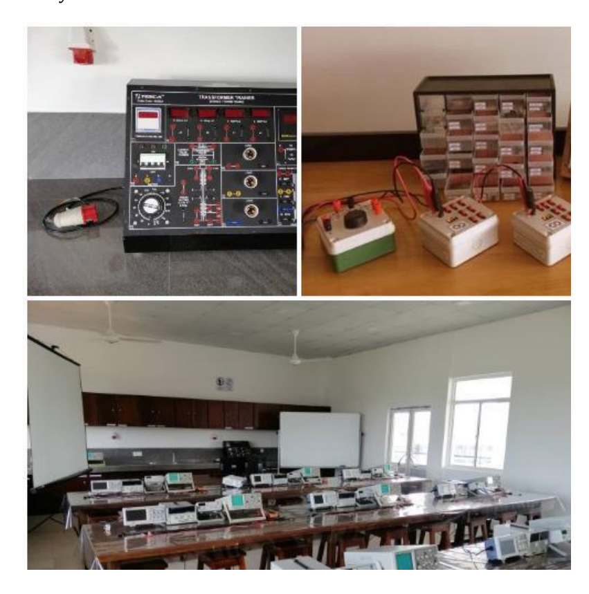
Fig. 7.5.1 Some equipment in the Electrical and Electronic Laboratory

The Electrical & Electronics Laboratory is well equipped and cater the needs of students according to the syllabus. The laboratory can facilitate around 40 students at one time. In this lab, the practical of courses such as Applied Electricity, Analog electronics and Digital Electronics are conducted. Fig. 7.5.1 shows some of those equipment in the laboratory.