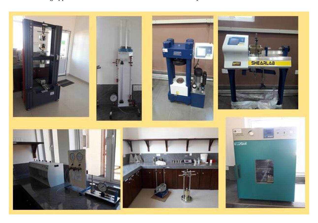
Fig. 6.5.1 Some equipment in the Material and Geotechnical Laboratory

The Surveying laboratory contains advanced surveying equipment such as total stations, digital levels and GNSS equipment. The laboratory is also equipped with basic surveying instruments such as theodolites and levels to conduct the surveying field works. The highway engineering testing apparatus such as bitumen ductillometer and Marshall testing apparatus are also available in the same laboratory.