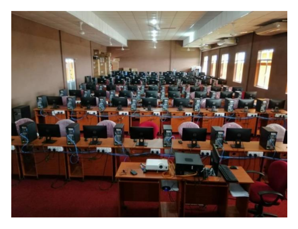
Fig. 7.5.4 Computer Laboratory

The computer laboratory can accommodate around 70 students and each computer has latest technology with internet facilities. Logger-Pro useful for data collection are installed on computers. Practical sessions of course units such as object-oriented programming, computer programming, telecommunication technology, web designing and statistics for engineering technology are conducted in this laboratory shown in Fig. 7.5.4.