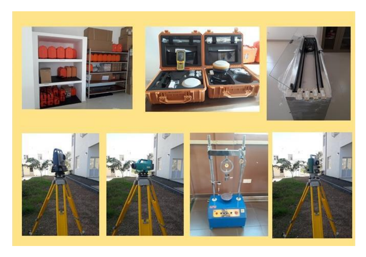
Fig. 6.5.2 Some equipment in the Surveying and Highway Laboratory