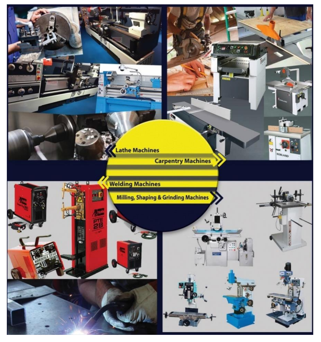
Fig.9.5 Some Machineries and Equipment available in Laboratories