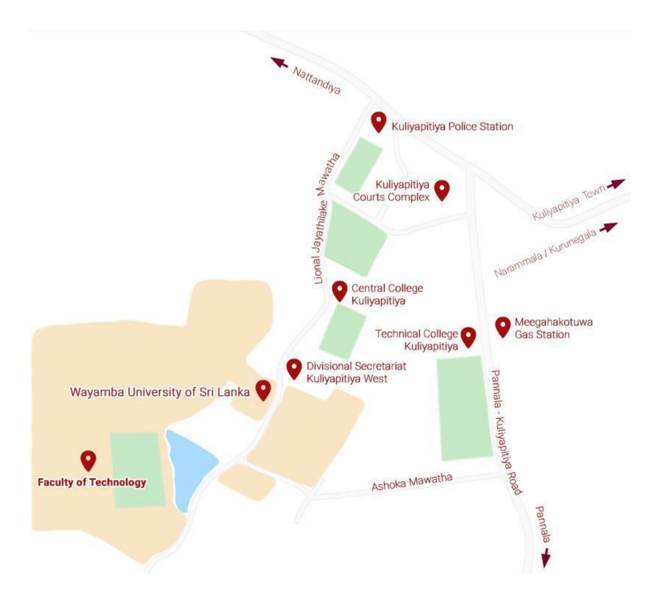
Fig. 1.5 Direction Map to Kuliyapitiya premises of the Wayamba University of Sri Lanka

Wayamba University is located at three premises - Kuliyapitya, Labuyaya and Makandura with easy access from Colombo, Kurunegala, and Kandy. These three locations are situated in an ideal environments surrounded by food and agribusiness, and industrial zones.