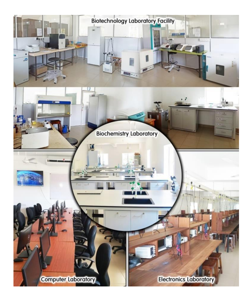
Fig. 8.5 (a) Nano laboratory facilities

Advance equipment available for undergraduate degree and postgraduate research programs can be listed as follows. (some of them are shown in Fig. 8.5 (b)).